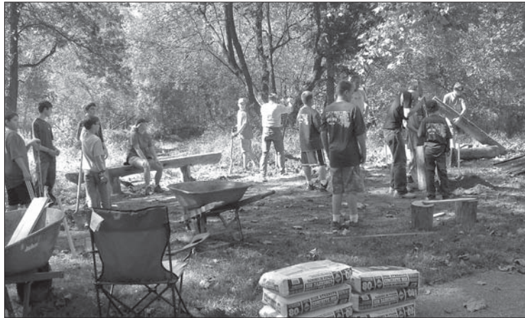
Getting the project built took two days in early October, and a total of about 200 man-hours.