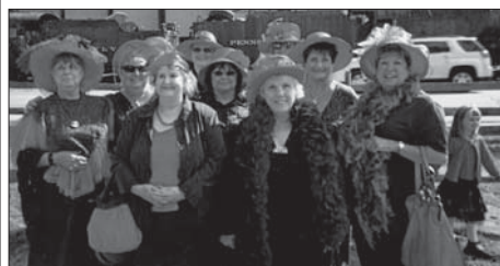
"The Happy Hatters," of the Red Hat Society, Bel Air area, attended a Victorian Tea and train ride on Oct. 4, sponsored by the Strasburg Railroad Company, Strasburg, Pa.